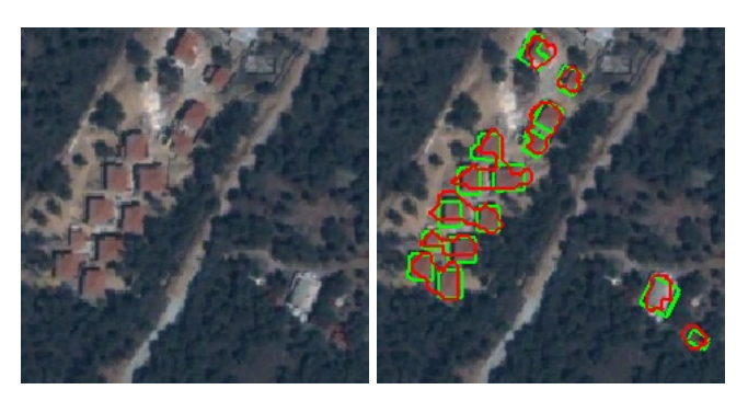
Fig. 1 . Automated building detection from very high resolution multispectral data. The developed algorithm managed to detect efficiently scene's buildings. The ground truth data are shown with a green color, while the detected buildings with red.

Very high resolution (VHR) satellite data are absolutely required for tackling the specific problem, while any spectral information more than the standard RGB enhance significantly the discrimination capabilities between the different man-made objects, soil, etc. Moreover, elevation data like Lidar, DSMs, etc can significantly ameliorate the detection pro-