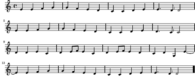
Fig. 3. Beethoven's melody Ode to Joy .

In this section, the hierarchical structure of rhythmic patterns is illustrated in a similar way to the hierarchical structure of chords. Beethoven's famous melody Ode to Joy is used as a model example of monophony (Fig. 3).