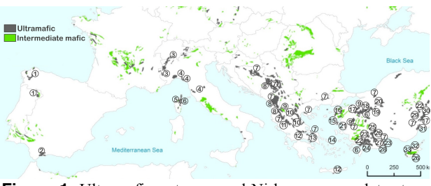
Figure 1. Ultramafic outcrops and Ni-hyperaccumulator taxa occurrence in Europe and western Anatolian peninsula.

Europe host large ultramafic outcrops (Figure 1), mainly situated in Iberian and Italian peninsulas, Corsica and the Balkan region (van der Ent et al., 2015). These regions are also home for a large plant hyperaccumulator diversity which can be utilised in agromining projects (Figure 1).