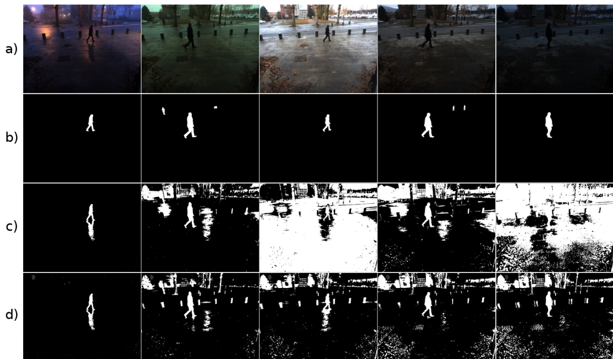
Fig 1: Segmentations obtained images for each time of day (with a learning on 7.30).

F-Measures were calculated for both classes (foreground and background). Evaluations were done for each colorimetric invariant and color space (Rank line) in order to determine which one of them performs the best for both classes. Results provided in Tables 1 and 2 pointed out RGB-Rank colorimetric invariant to perform the best for this application.