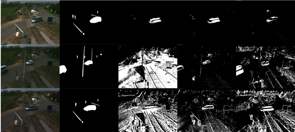
Fig 2: Segmentations obtained with a learning base L1. From left to right : original image, ground truths images, without colorimetric invariant, with HSL, with RGB-Rank

used for other processes such as tracking, without having to assume as much errors in it. A mathematical morphology post-processing could also be applied to resulting segmentation to remove noise and close holed foreground regions.