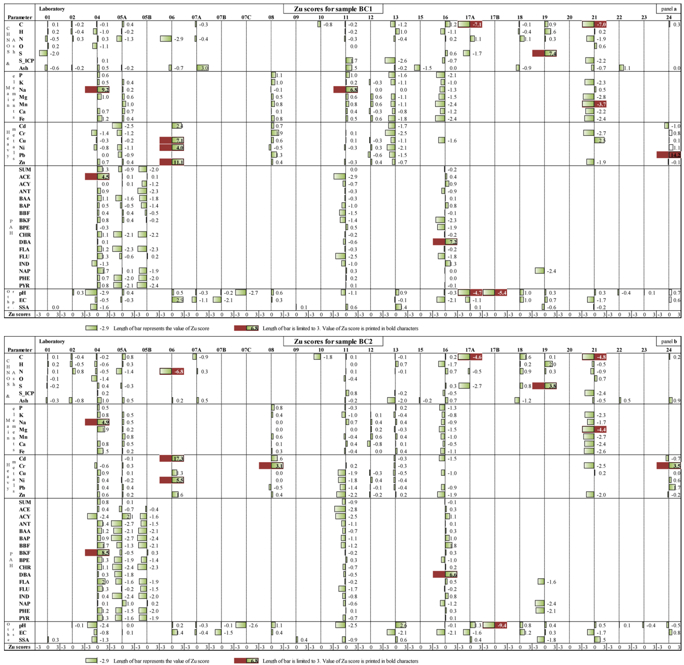
Figure 1. continued

In case a laboratory reported multiple results for a given parameter, the robust mean was used as laboratory value and the robust SD of this mean as a measure of the repeatability of the analysis within this laboratory (repeatability SD). For comparison, a reference value was defined for each parameter, which was based on currently recommended