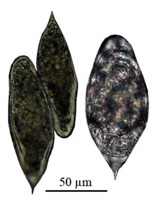
Fig. 1 Egg morphology of S. haematobium from Corsica. Two egg morphotypes were observed: on the left, two non-typical S. haematobium eggs; on the right, a typical S. haematobium egg