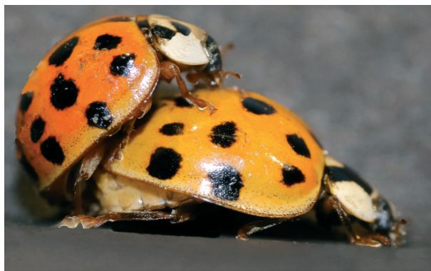
Figure 1. A male climbing on top of the female during the mating process in the harlequin ladybird.

Each female was presented with a single male for a period of 24 h, and this was repeated three times with three different males during the course of a week. This procedure minimized density effects (e.g., delayed growth or reduced fecundity in paired individuals due to competition) while leaving time for multiple copulations to occur. Males were randomly chosen from the stock colony obtained with different mixing of individuals from the six populations to minimize bias due to male identity. We then carried out the following two measurements on these