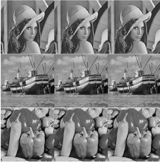
Fig. 1. From left to right, the noisy image with \sigma = 15 , the reconstructions with respectively Bai and Feng's algorithm [1] and Algorithm 1, the fractional order \alpha is equal to 1.5. From top to bottom, the Lena, Boat and Peppers images.