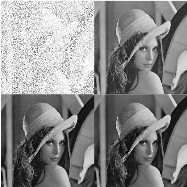
Fig. 3. From left to right and up to down, the reconstruction with respectively Algorithm 1, Laplace equation and total variation regularization [10].