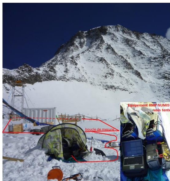
Fig. 1, The “Tete Rousse glacier” is located at 3200m altitude, the equipment is installed during 10 days in a tent, and the operators installed the 80x80 m loops generally on the snow.

Since the catastrophic subglacial lake outburst flood in 1892, the risk of a new event in the glacier of Tête Rousse, in the Alps (close to the Mont Blanc) has been thoroughly studied until now (Vincent et al., 2010, 2012). In the last 5 years, the combination of several geophysical technics has provided valuable input for the glaciologists to better understand the structure and the evolution of sub-glacial liquid water (Garambois et al, 2015). Ground penetrating radar which has proven for long to be a very efficient tool in glacial environment has been used here, providing fine imaging of internal structures, bed rock depth estimate, crevasses and the top of the main cavity. In addition, Magnetic resonance has been performed in 2009, confirming the existence of the liquid water volume, and applied in 2010 along a tight array of loops to provide a 3 D image and an estimate of the total water volume. Indeed, this latter parameter is of major importance to evaluate the level of risk.