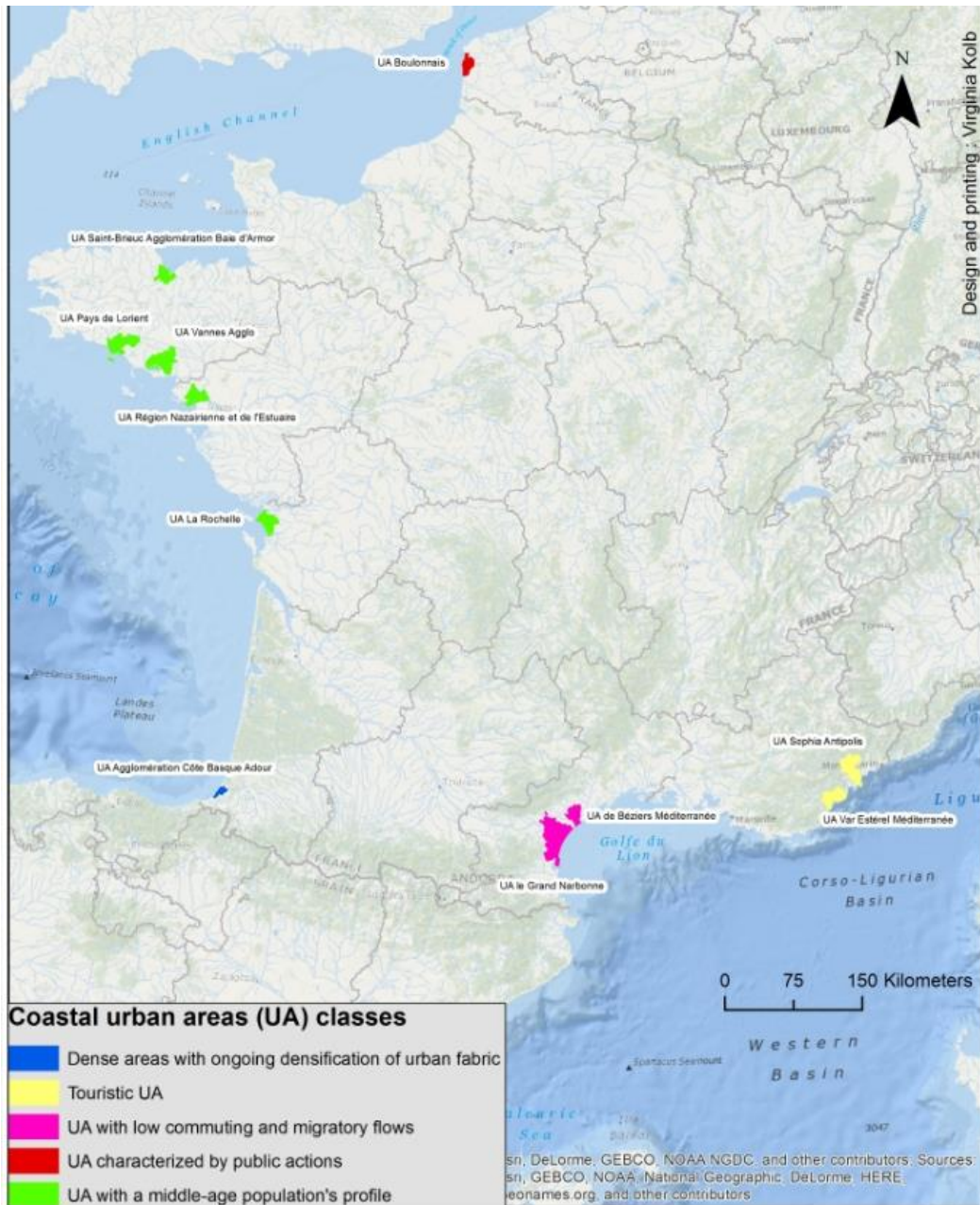
Figure 3: Urban areas' location according to the Hierarchical Clustering at the coastal context