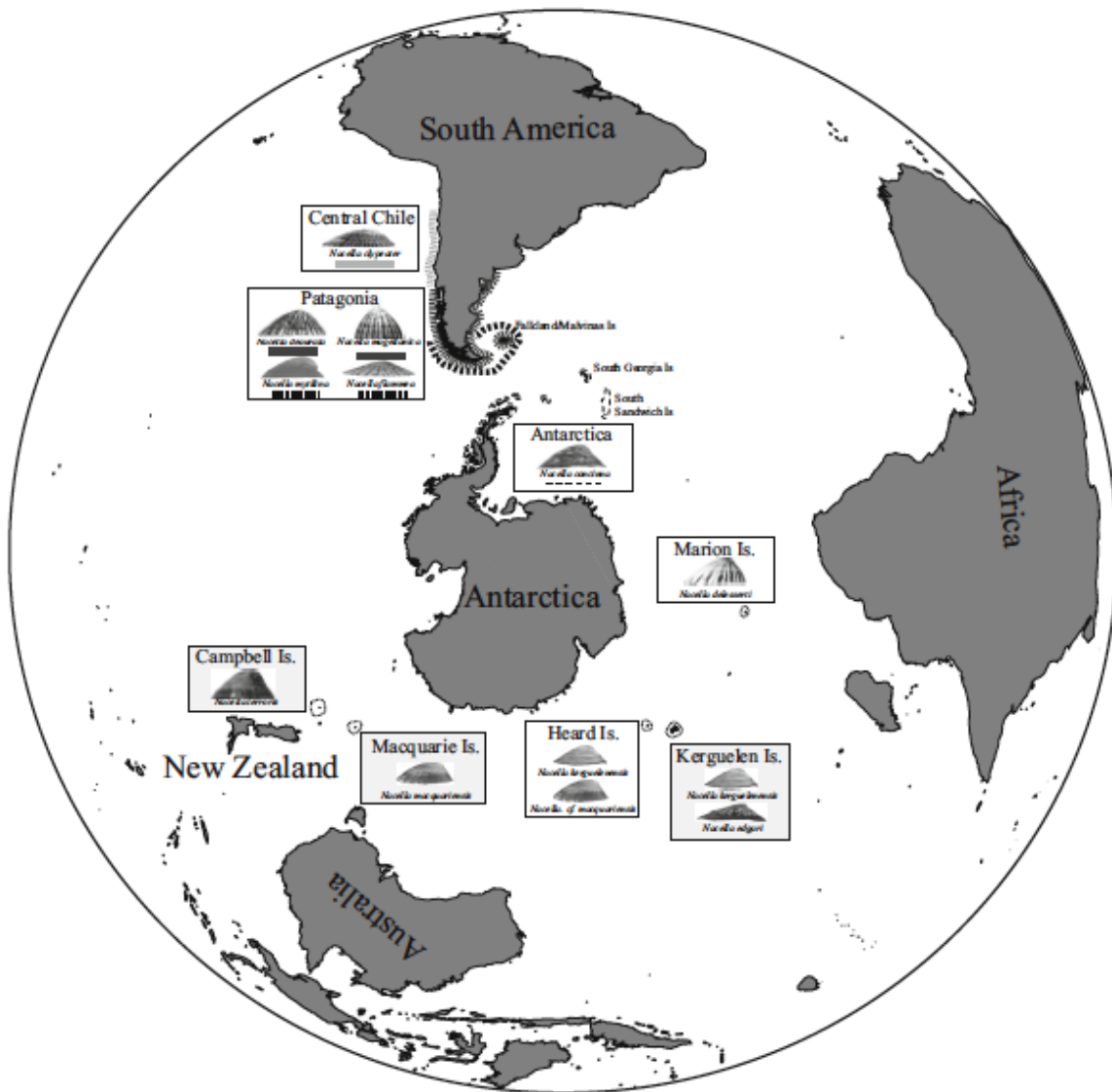
Fig. 1 Distribution of Nacella species in different provinces of the Southern Ocean (South America, Antarctica, and sub-Antarctic islands). Dashed lines along the coast indicate the approximate

distribution of the different lineages. White rectangles contain the analyzed species of Nacella