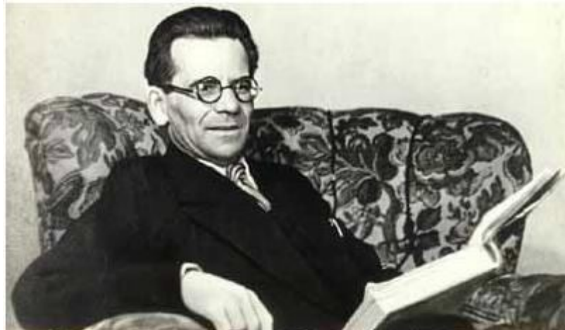
Fig.1. Sergey Lebedev

Described by some as the “Soviet Alan Turing,” Sergey Lebedev had been thinking about computing as far back as the 1930’s, until interrupted by war. In 1946 he was made director of Kyiv’s Institute of Electrical Engineering. After the second war some stories of “electronic brains” in the West began to circulate and his interest in computing re-lived.