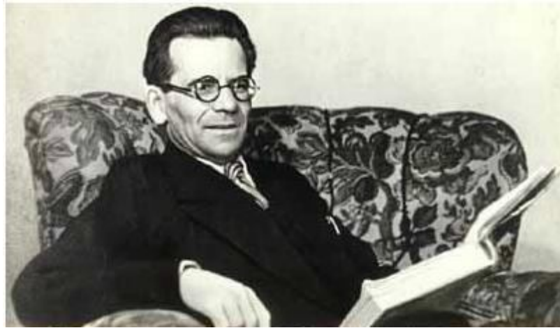
Fig.1. Sergey Lebedev

Described by some as the “Soviet Alan Turing,” Sergey Lebedev had been thinking about computing as far back as the 1930’s, until interrupted by war. In 1946 he was made director of Kyiv’s Institute of Electrical Engineering. After the second war some stories of “electronic brains” in the West began to circulate and his interest in computing re-lived.