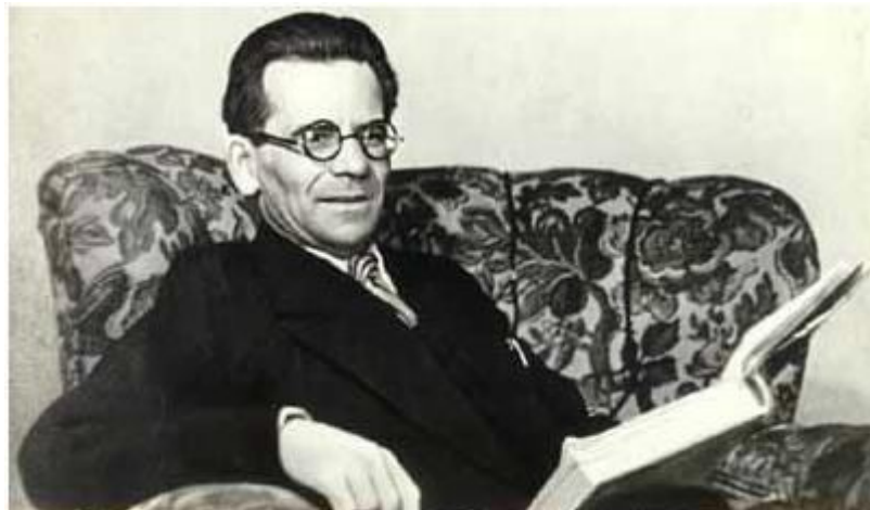
Fig.1. Sergey Lebedev

Described by some as the “Soviet Alan Turing,” Sergey Lebedev had been thinking about computing as far back as the 1930’s, until interrupted by war. In 1946 he was made director of Kyiv’s Institute of Electrical Engineering. After the second war some stories of “electronic brains” in the West began to circulate and his interest in computing re-lived.