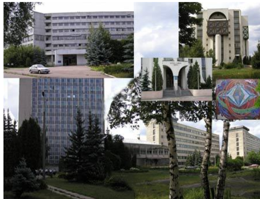
Fig.4. Cybernetic Center NASU planned by V.Glushkov in 1972 was organized in 1992. The main organization - V.Glushkov Institute of Cybernetics of the National Academy of Science

Author of this paper was working for the Institute of Cybernetics in 1980-86 and has started then General Knowledge Machine project.