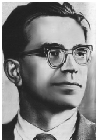
Fig. 3. Victor Glushkov

Victor Glushkov (August 24, 1923 – January 30, 1982) was the founding father of information technology in the Soviet Union (and specifically in Ukraine), and one of the founders of Cybernetics. He was born in Rostov-on-Don, Russian SFSR, in the family of a mining engineer. He was graduated from Rostov State University in 1948, and in 1952 has proposed solution to the Hilbert's fifth problem and defended his thesis in Lomonosov Moscow State University.