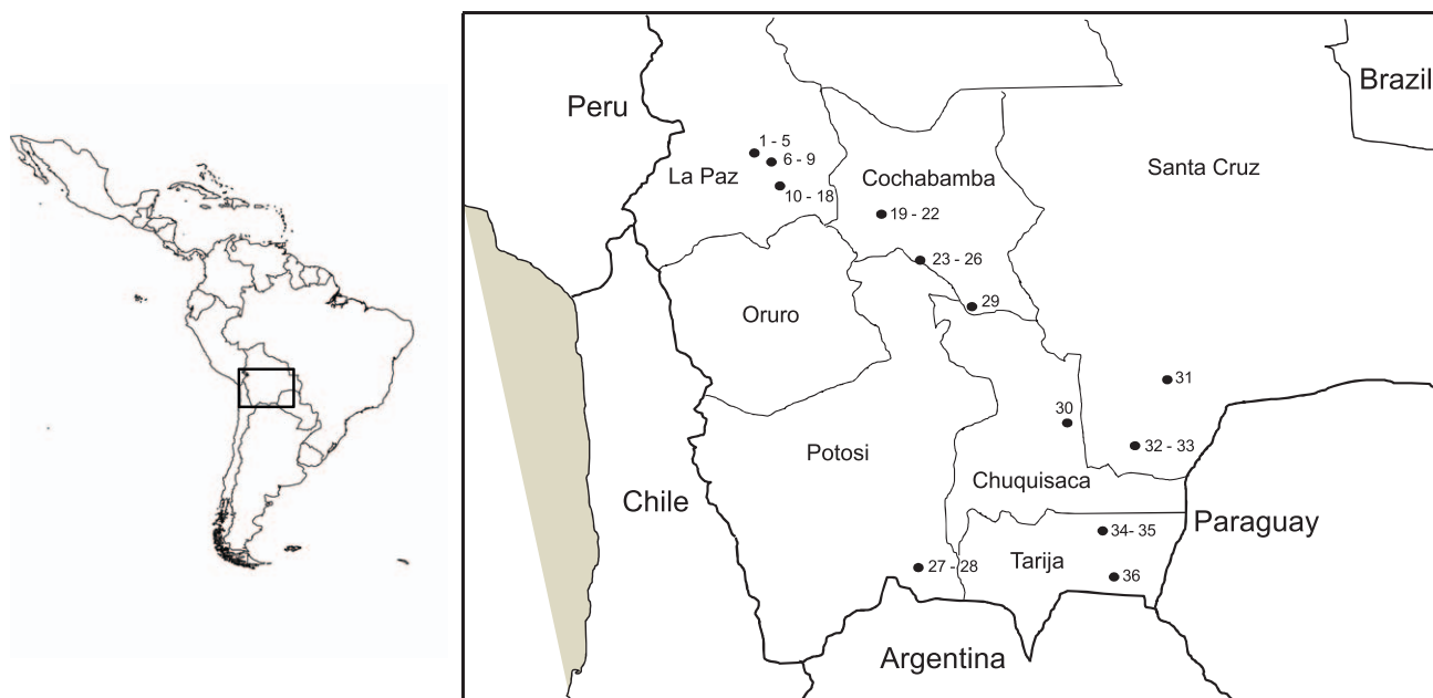
Figure 1. Sampling sites of wild populations of Triatoma infestans in Bolivia. The sites were numbered from 1 to 36, Bolivian department names are indicated, for the DTU T. cruzi results see in Table 1. doi:10.1371/journal.pntd.0001650.g001

The triatomines were sampled in sylvatic environments from April to November 2009 (Figure 1). Collections were carried out using mice-baited adhesive traps [40] in different ecotopes such as