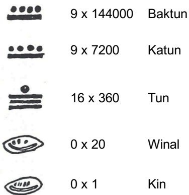
FIG. 2. Long Round number \mathcal{LR} = 9.9.16.0.0 = 9 \times 144000 + 9 \times 7200 + 16 \times 360 + 0 \times 20 + 0 \times 1 = 1366560 present on page 24 of the Dresden Codex. Long Count numbers are represented vertically using the Maya vigesimal system: a shell represents 0, a dot 1 and a bar 5.

gorian Calendar date 11 August 3114 BC according to the Goodman-Martinez-Thompson (GMT) correlation [7 and 8]. An interesting example of Long Count number can be found in the introduction of the Venus table on page 24 of the Dresden Codex: the so-called Long Round number \mathcal{LR} = 9.9.16.0.0 = 1366560 days, a whole multiple of the Tzolk'in, the Haab', the Calendar Round, the Tun, Venus and Mars synodic periods: \mathcal{LR} = 5256 \times 260 = 3744 \times 365 = 72 \times 18980 = 3796 \times 360 = 2340 \times 584 = 1752 \times 780 . The Long Round number (Fig. 2) can be expressed as \mathcal{LR} = 9 \times 144000 + 9 \times 7200 + 16 \times 360 + 0 \times 20 + 0 \times 1 as a function of the Long Count periods (the 1-day Kin, the 20-day Winal, the 360-day Tun, the 7200-day Katun and the 144000-day Baktun) [9]. The Long Count periods are commensurate with the Tzolk'in and the Haab': \{\text{LCM}(260, P_i)/P_i = 13, \text{LCM}(365, P_i)/P_i = 73, P_i = 18 \times 20^i, i > 0\} . The XXI century saw the passage of a new Maya Era on the day of the winter solstice 21 December 2012 (GMT correlation) or 13(0).0.0.0.0 4 Ahau 3 Kankin, a date carved on Monument 6 of Tortuguero (present-day Mexico), a Maya stone from the VII century AD [10].