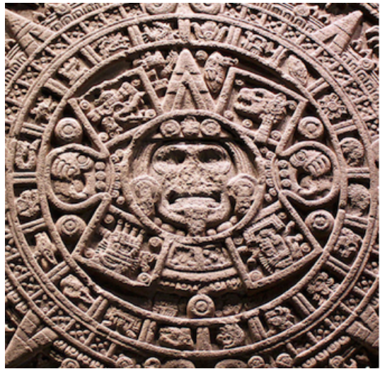
FIG. 3. Aztec Calendar Stone representing the Five Creations of the Maya/Aztec civilization. The stone, probably carved during the post-Classic period (1300 to 1521 AD), was rediscovered in 1790 during the construction of the cathedral of Mexico City, Mexico.

The Mayan cyclical concept of time implied that current and future events were pre-determined from past events in an ever-repeating cosmological grand cycle. For divinatory purposes, Mayan priests-astronomers developed an elaborate numerology based on the Mayan arithmetical model of astronomy. This numerology allowed them to discriminate between two dates over very long period of time: the combination of the Tzolk'in, the Haab' and the Kawil-directions-colors differentiates two dates every \mathcal{X}_1 = \text{LCM}(260,365,3276) = 1195740 days \approx 3273 years and the 13 Baktun Maya Era every 1872000 days \approx 5125 years. Table IV gives the full Mayan Calendar dates of important mythical dates deduced from Equ. 7. The previous Maya Era is characterized by two