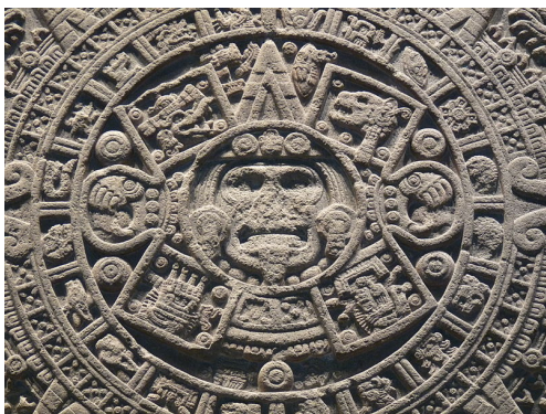
FIG. 1. Mayan/Aztec Calendar Stone representing the Five Suns, discovered in 1790 at El Zócalo, Mexico City, Mexico.

Mayan priests-astronomers were known for their astronomical and mathematical proficiency, as exemplified in the Dresden Codex, a XIV century CE bark-paper book containing many astronomical tables correlated to ritual cycles. However, due to the zealous role of the Inquisition during the XVI century CE Spanish conquest of Mexico, number of these Codices were burnt, leaving us with few information on Pre-Columbian Mayan culture. Thanks to the work of Mayan archeologists and epigraphists since the early XX century, the few Codices left, along with numerous inscriptions on monuments, were deciphered, underlying the importance of the concept of time in Maya civilization. This is reflected by the three major Mayan Calendars, reminiscent of the Mayan cyclical conception of time: the Calendar Round, the Long Count Calendar and the Kawil-direction-color cycle.