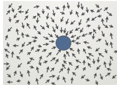
Figure 2. Halo of non-random oriented gravitational dipoles around a body (or a galaxy) with baryonic mass M_b