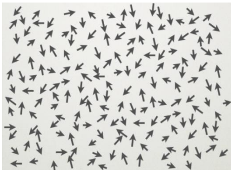
Figure 1. Randomly oriented gravitational dipoles (in absence of an external gravitational field)

P_{g \max} = [0.06 \pm 0.02] \text{ kg/m}^3 , in calculations we use P_{g \max} = 0.06 \text{ kg/m}^2 \approx 28.5 M_{\text{Sun}} / \text{pc}^2 . In addition, following the previous results [8, 11, 12, 14, 16], in calculations concerning dipoles, we use the mass of a pion m_\pi (which is a typical mass in the physical vacuum of quantum chromodynamics).