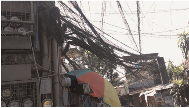
Picture 1. The wires hanging over Pansol in Quezon City, Metro Manila, February 2013.