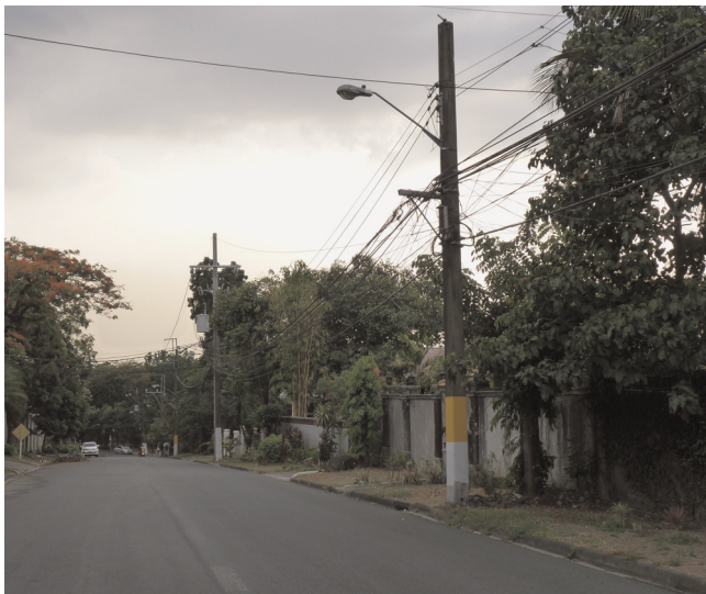
Picture 2. Loyola Grand Villas, Quezon City, Metro Manila, April 2014.

provision. The office in charge of the urban poor will usually follow the design of electrification programs, but overall, city governments have no trained personnel in order to deal specifically with energy issues. They have yet to assert themselves in order to go beyond their role of mere advisor to Meralco. Indeed, while electrification programs are carried out with the intervention of both the DU and the concerned LGUs, it is notable that Meralco is ultimately the entity that makes the decision. Executives of the DU involved in these electrification programs reveal that the company chooses the areas that will benefit from their action depending on the relationship that they have with city governments: “We work with the city governments that are willing to work with us, that are efficient” (Interview E).