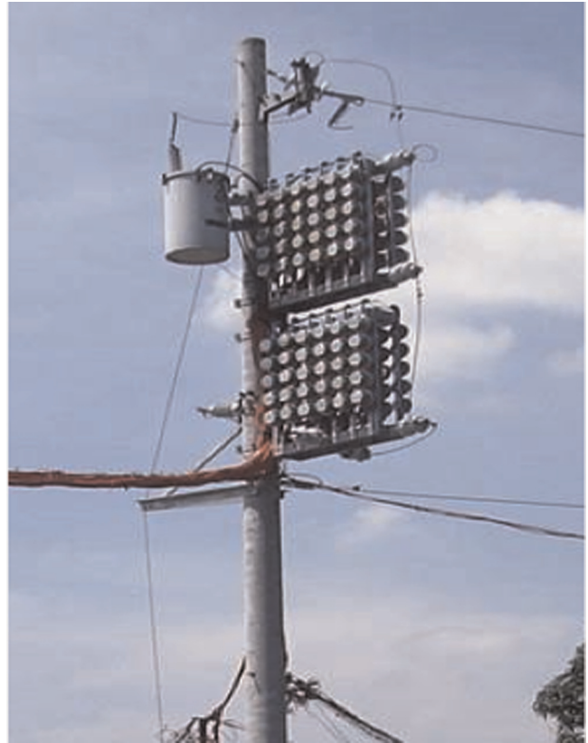
Picture 3. An elevated metering cluster.

The interaction between administrative decentralisation and the sector's liberalisation has had important consequences for energy policies. The central State being focused only on questions of security of supply and price-setting, LGUs and other urban actors had to step up and become a true interlocutor to Meralco. And through city governments, urban poor organisations can more easily express their concerns and wishes: this evolution of energy governance stresses the need for “local development” through popular participation and empowerment. Henri Coing (2002) insists on the idea that regulation is not all about the relationship between the regulator and the regulated: providing electricity requires that users be consulted and integrated into the discussions. In the case of urban poor communities, this point is critical: inhabitants who are refused access to the service tend to tap illegally into the network, thus disturbing the network and inducing costly efforts of repression on the part of the DU (Wang et al.,