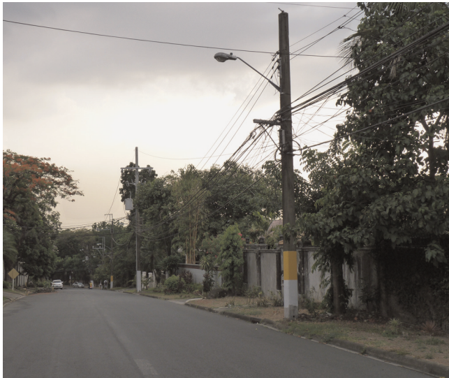
Picture 2. Loyola Grand Villas, Quezon City, Metro Manila, April 2014.

provision. The office in charge of the urban poor will usually follow the design of electrification programs, but overall, city governments have no trained personnel in order to deal specifically with energy issues. They have yet to assert themselves in order to go beyond their role of mere advisor to Meralco. Indeed, while electrification programs are carried out with the intervention of both the DU and the concerned LGUs, it is notable that Meralco is ultimately the entity that makes the decision. Executives of the DU involved in these electrification programs reveal that the company chooses the areas that will benefit from their action depending on the relationship that they have with city governments: “We work with the city governments that are willing to work with us, that are efficient” (Interview E).