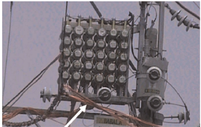
Picture 4. An elevated metering cluster.

2010). In this context, the trend initiated by Meralco may be generalised, to the benefit of the urban poor, but also of the DU itself. It is very much in line with the ideas that have prevailed in development theory and practice since the 1990s, and can be seen as another side of the neoliberal nature of the electricity reform. Mohan and Stokke (2000) indeed argue that “new managerialism” underlines the potential of decentralised action in order to weaken central ministries, and place the responsibility of service delivery on local authorities' shoulders. 20 It also translates into a financial