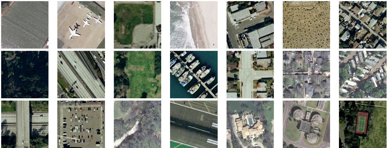
Fig. 1. Merced dataset

Our final choice of patch size is 80 \times 80 with 16 pixels distance between patch center (cf. Fig. 2 for the results of the tuning experiments). The tuning experiments regarding patch and overlap size were done with the histograms of size 6 \times 4 , for the efficiency of the calculation. A larger histogram of size 8 \times 6 was chosen for the final evaluation, giving an improvement over the smaller size and producing descriptors of length 96. We only report the results using CNC, as combination with other shape attributes as well as processing the RGB channels separately does not result in improvement over the base local approach and greatly increases the complexity of the approach.