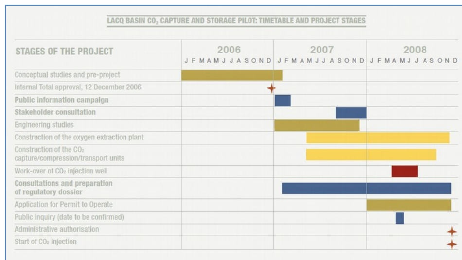
Illustration 2: Lacq CCS pilot project, draft timetable in 2007 October (Total 5 )

The launch of the Lacq CCS project was announced on 8 February 2007, while CO 2 injection was expected to begin at the end of 2008 and then last for two years. At the moment, no subsequent phases of the Lacq project had yet been decided, but the necessary long-term injection site monitoring. The first « Lacq Project Information Dossier », a key communication effected with the support of a consulting team (C&S Conseils) and issued by Total in October 2007 5 , only shows a draft project timetable for the near future (Cf. illustration 2 below), with a view to carrying out the next mandatory Public Inquiry and injection starting.