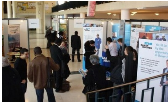
Illustration 5: in Sud Ouest journal, 2010 May 25th, and La République des Pyrénées, 2010 November 19th (Extracts)