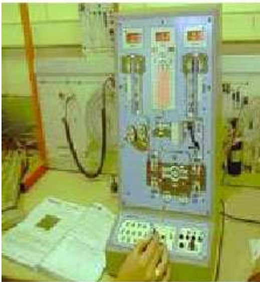
Figure 2. Example of a braking simulation system, presented p. 4 (Ndoumatseyi Botongoye, 2007)

Landry Ndoumatseyi-Botongoye (Ndoumatseyi Botongoye, 2007) has conducted a study in Gabon with students enrolled in a maintenance course who used this kind of resource. According to him, the simulation models look like real systems but because of their scaletall, it is possible to show that all components may not be at the same place as in real systems.