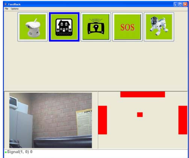
Fig. 3 Appearance of the feedback screen. The Feedback application has been instructed to divide the window into three panels. In the top panel, the available selections (commands) appear as icons. In the bottom right panel, a feedback stimulus by the BCI (matching the one the subject has been training with) is provided; the user uses his learnt modulation of brain activity to move the cursor at the center to hit either the left or the right bars – in order to focus the previous or following icon in the top panel – or to hit the top bar – to select the current icon. In the bottom left panel, the Feedback module displays the video stream from the video camera that was chosen beforehand in the operation.

Whenever the user select an action that, rather than changing the internal context of the core (i.e. selects a non-leaf item of the cascaded menu), it instructs the system to undertake a physical action, the Control Unit fulfils the user’s demands by sending the appropriate control signals to the output appliances. Drivers are used to offer a homogeneous interface from the Control Unit’s point of view. In some cases, previously existing drivers are utilized for the devices, whereas in other cases (e.g. the robotic platform device) the driver has been designed “ad hoc” for the specific system.