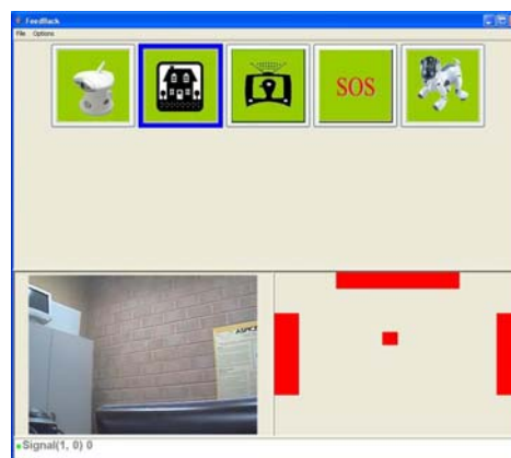
Figure 2. Appearance of the feedback screen. The Feedback application has been instructed to divide the window into three panels. In the top panel, the available selections (commands) appear as icons. In the bottom right panel, a feedback stimulus by the BCI (matching the one the subject has been training with) is provided; the user uses his learnt modulation of brain activity to move the cursor at the center to hit either the left or the right bars – in order to focus the previous or following icon in the top panel – or to hit the top bar – to select the current icon. In the bottom left panel, the Feedback module displays the video stream.

Figure 2 shows a possible appearance of the feedback screen. In this case, choices are pictured as button-shaped icons. This is possibly the most simple interface, and for sure the most practical to be operate with a reduced set of available input signals.