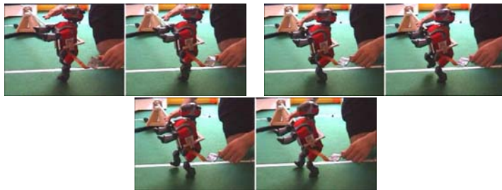
Figure 3: AIBO biped walking.

A Biped Locomotion Strategy for the AIBO ERS-210 Quadruped Robot has been developed and presented in [14] (see Figure 3). Although AIBO has several limitations which make biped locomotion a challenging task, such as passive feet, a high baricenter in the erect posture, and relatively weak actuators, we showed that it is possible to realize a biped gait by properly designing the single and double support phases. This approach is in contrast with most previous works, in which a biped mechanism is built having already in mind a certain control strategy.