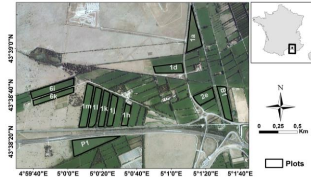
Figure 1: Location of study site (Domaine du Merle). Black polygons delineate training irrigated grassland plots.

the overflow of ditches and canals which bring water "upstream" the plots. Each plot is irrigated on average each 10 days. Plots are harvested three times a year, in May, July and September.