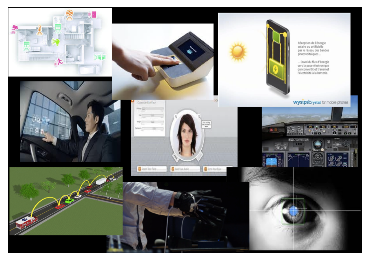
Figure 2: Mood board from Case 2 displaying various innovations innovation in terms of safety, new driving panels, infrastructure or new forms of energy.

cars. They also looked into infrastructure: connected cars in smart cities, evolving like a swarm. In terms of aesthetics, they chose very unusual vehicles that helped them reframe the vision of what a car is. Mostly their mood boards showed technological surveys of car innovations (see Figure 3).