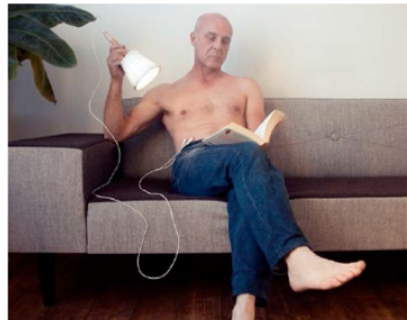
ectrocyte Appendix, projet Protofarm. Revital Cohen, 200