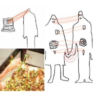
Critical design, « What if your friends grew on your body? »