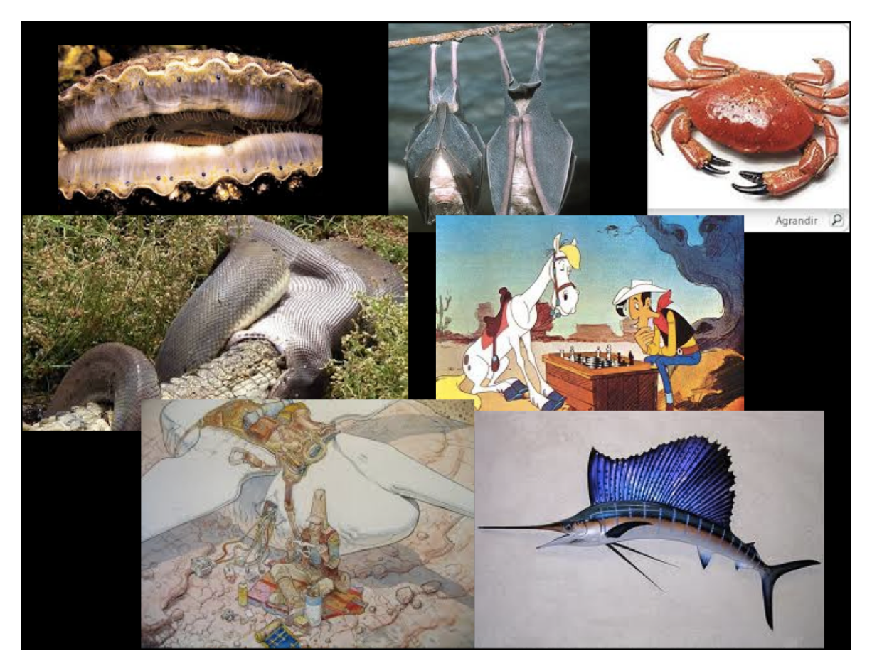
Figure 4: Mood board from Case 2 displaying inspirations in terms of physical sensations such as wet crabs, fish, that conveyed smooth, sliding, to the point of slimy sensations and imaginary references: cartoons showing a partnership between the person and her vehicle, whether "fusional" or friendly. It induces an ambiguity between the hyper adapted / connected / controlled car and the chummy, comfortable, fun vehicle.