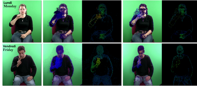
Fig. 2: Spatio-temporal representation of trajectories and MoG kinematic representation. Each row represents a spatio-temporal gesture corresponding to two days. The second and third columns illustrate the dense trajectories and their kinematic descriptors, respectively. The fourth and fifth columns correspond to the semi-dense trajectories and their kinematic descriptors.

Semi-Dense trajectories [13] are computed from a set of weakly salient points, tracked using a coarse-to-fine prediction and matching approach, allowing a high degree of parallelism and dominant movement estimation. This technique produces high density trajectory beams, robust to large camera accelerations and allowing statistically significant trajectory based representation, with a good trade-off between accuracy and performance.