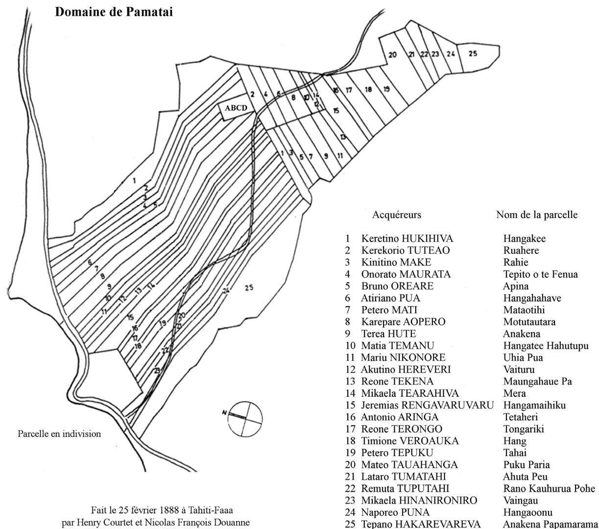
Figure 2. Map of the landowners in Pamatai, 1888. Redrawn by the author, based on Conte 1994 and the copy of the original map (Direction des Affaires Foncières, Pape’ete).