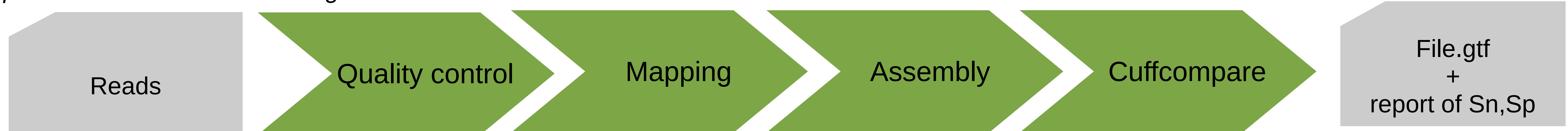
Figure 1: Pipelines used for benchmarking

The above flowchart (Fig.1) was run for two strategies of transcriptome assembly: The reference-based assembly using Cufflinks and Grit, de novo assembly using Trinity. The step of RNA-seq reads mapping to a reference genome, is done only for Cufflinks and Grit.