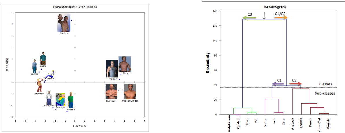
FIGURE 3 – INDIVIDUALS REPRESENTATION INTO A TWO-DIMENSIONAL PLANE 5 (LEFT) and HIERARCHICAL TREE OF SOFTWARE (RIGHT)