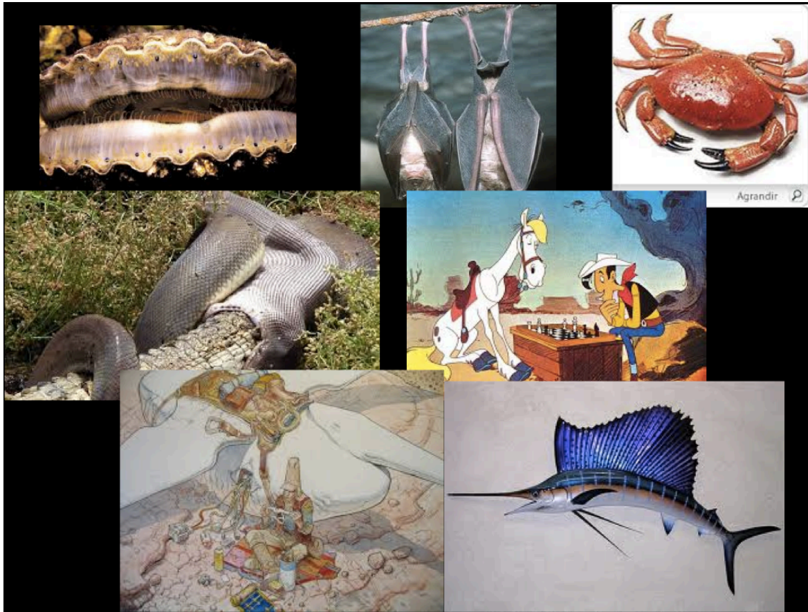
Figure 4: Mood board from Case 2 displaying inspirations in terms of physical sensations such as wet crabs, fish, that conveyed smooth, sliding, to the point of slimy sensations and imaginary references: cartoons showing a partnership between the person and her vehicle, whether “fusional” or friendly. It induces an ambiguity between the hyper adapted / connected / controlled car and the chummy, comfortable, fun vehicle.