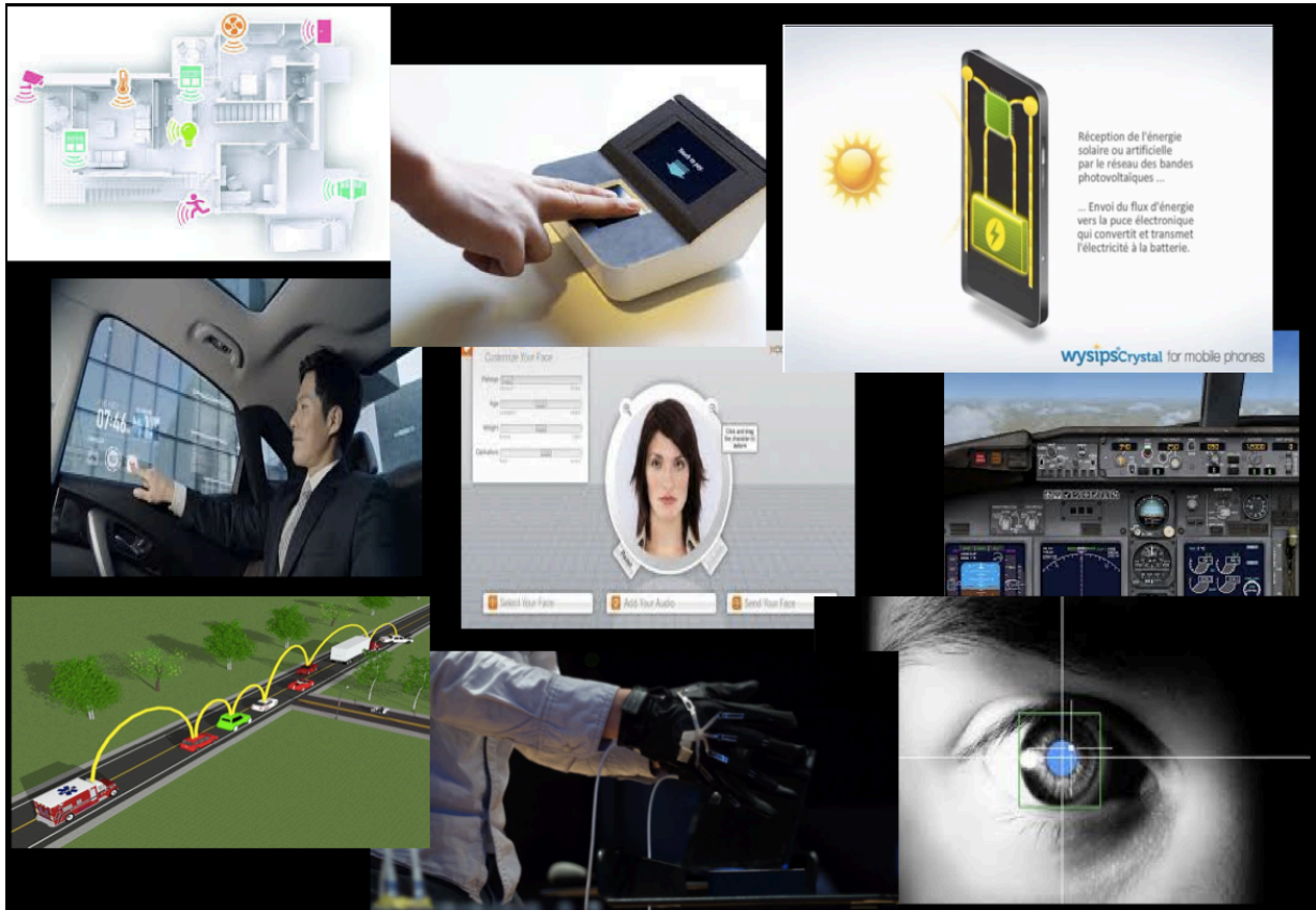
Figure 2: Mood board from Case 2 displaying various innovations innovation in terms of safety, new driving panels, infrastructure or new forms of energy.

cars. They also looked into infrastructure: connected cars in smart cities, evolving like a swarm. In terms of aesthetics, they chose very unusual vehicles that helped them reframe the vision of what a car is. Mostly their mood boards showed technological surveys of car innovations (see Figure 3).