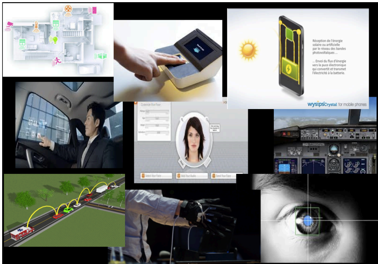
Figure 2: Mood board from Case 2 displaying various innovations innovation in terms of safety, new driving panels, infrastructure or new forms of energy.

cars. They also looked into infrastructure: connected cars in smart cities, evolving like a swarm. In terms of aesthetics, they chose very unusual vehicles that helped them reframe the vision of what a car is. Mostly their mood boards showed technological surveys of car innovations (see Figure 3).