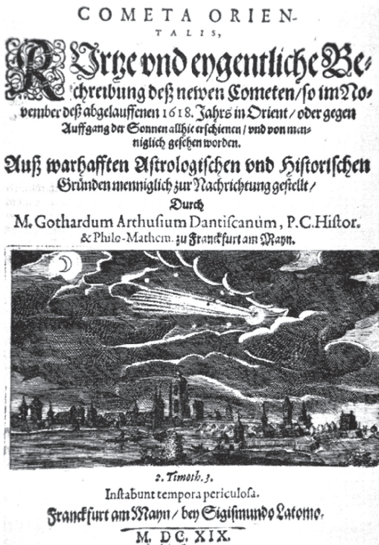
Fig. 1 The Comets of 1618

Galileo's entrée into this parade and the positions he expresses in it are very surprising. Never having observed the comets himself, he waited until an anonymous treatise by the Jesuit mathematician Horatio Grassi, De Tribus Cometis Anni 1618 Disputatio Astronomica (1619) introduced the issues of the scholarly discussion about these spectacular objects. Grassi's views are ones that Galileo should