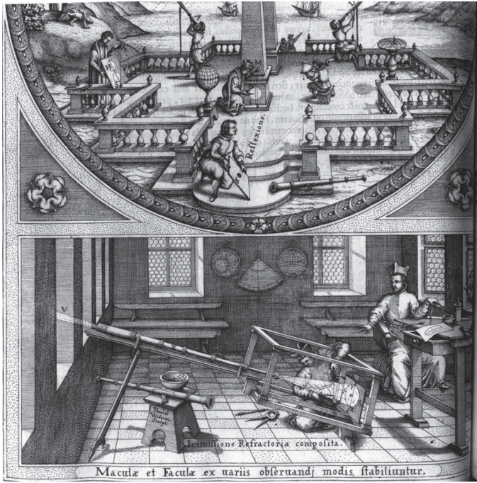
Fig. 2 Chistophoro Scheiner, Rosa Ursina (1626–1630)

to minimize the role of the instrumental mediation so the sunspots will be “seen without a tube, by the eye of any man.” 38