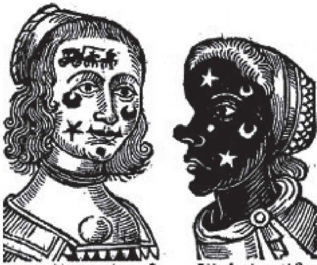
Fig. 2 Bulwer 1653

In general, Bulwer does not seem to distinguish between different forms of body 'painting', which include tattooed representations, or simply designs, or even the use of cosmetics to change the hue of the skin (see Fig. 2). Thus he denounces the Virginian women for the same 'bravery' he sees in 'the Ladies of Italy', who, "to seeme fairer than the rest, take a pride to besmeare and paint themselves." 24 He also tends to mention more instances of non-representational tattooing than the rare case of the fish or beast, such as the practice of the 'Egyptian Moores, both men and women," who "for love of each other, distaine their Chins into knots, and flowers of blew, made by the pricking of the skin with needles, and rubbing it over with inke and the juyce of an herb." 25 He complains of all of these 'Nations', the Virginians, the Englishwomen, the Italians, and the Moors alike, "what needlesse paine they put themselves unto to maintaine their cruell bravery! Nay, which is yet stranger, they