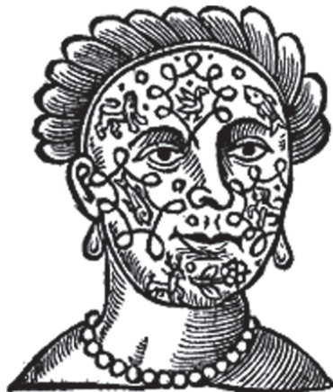
Fig. 1 Bulwer 1653.

The Virginian women adorne themselves with paintings; some have their Face, Breasts, Hands, and Legs, cunningly embroidered with divers workes, as Beasts, Serpents, artificially wrought into their flesh with black spots. 22