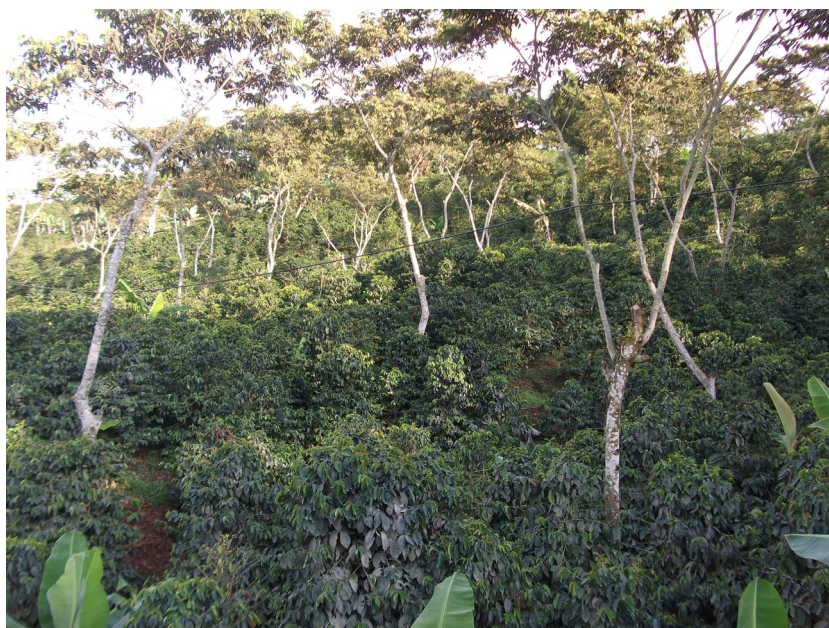
Fig. 1 Shaded coffee monoculture in Aguadas, Caldas, located in the heart of Colombia's coffee growing region (the "Coffee Triangle")

In all systems, annual input and output data were averaged over the previous five crop cycles, from 2006–2007 until 2010–2011. The data collection took place during 2010–11 which had average climate for the respective regions. Field