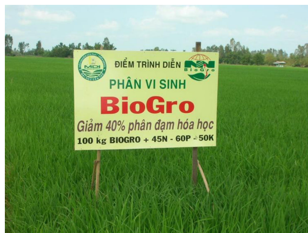
Fig. 1 Rice plots treated with biofertilizer also received reduced chemical fertilizer as compared with control plots

Our objectives were to determine the effects of a commercial inoculant biofertilizer on chemical fertilizer reductions and rice yields in terms of magnitude and reproducibility over multiple growing seasons. We hypothesized that the efficacy of the biofertilizer is dependent, in part, on the rate and timing of supplementary chemical fertilizer application. In testing this hypothesis, we deliberately encouraged participating farmers to modify the amount of chemical fertilizer they applied in conjunction with the biofertilizer according to their own preference (Fig. 1). This experimental design produced a