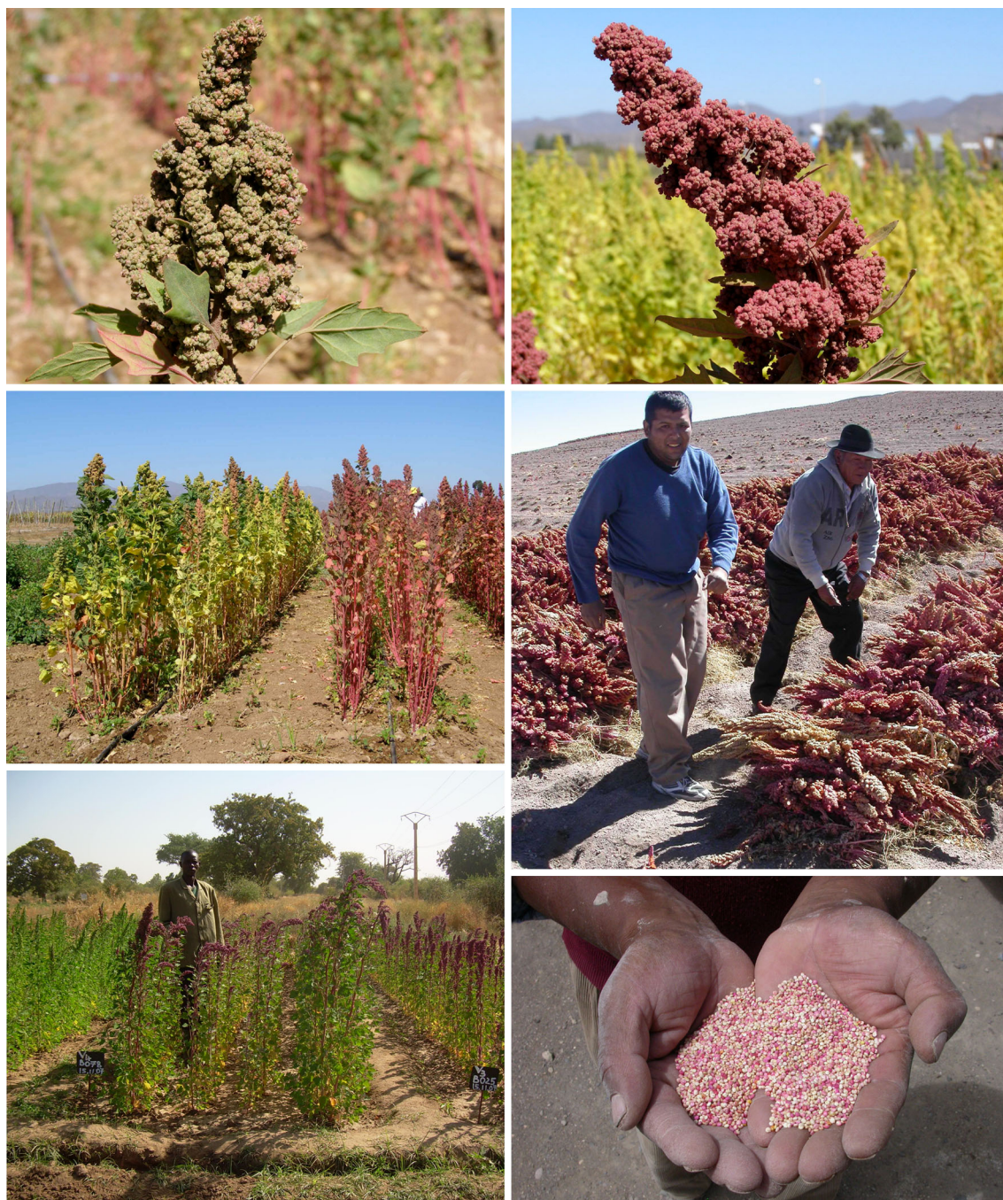
Fig. 1 Top left and right inflorescence of a Chilean genotype; center left trial in Chile (garden of Chilean varieties); center right quinoa cultivation in the Chilean/Bolivian altiplano ; bottom left and right trial and harvest in Mali, West Africa.

Brazil, trials are ongoing to use quinoa as a cover crop in winter (Spehar and Souza 1993). Many other countries are performing tests on quinoa with very promising results. For example, its adaptability to both northern and southern European conditions has been investigated (Jacobsen 2003; Pulvento et al. 2010). Denmark and the Netherlands are important areas for quinoa improvement and breeding. In particular, a daylength-neutral quinoa variety, bred and selected at the University of Copenhagen from material originating from