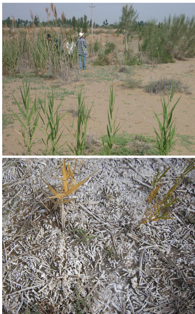
Fig. 1 Drought and salinity are two main constraints for agricultural production in northwest China. These photos were taken in Gansu, China. The upper photo depicts drought and desertification, and the lower photo depicts soil salinization

Studies have shown that silicon application may increase tolerance to salinity and drought in plants (Liang et al. 2007; Bauer et al. 2011). Hence, application of silicon may be a facile means to increase crop yield during drought or in salty soils. Moreover, because silicon can improve drought tolerance of plants, its application may help reduce the need for irrigation, which in turn would reduce salinization of crop land. Moreover, silicon is noncorrosive and pollution-free, and therefore, silicon fertilizer is a high-quality fertilizer for developing ecologically green agriculture. Several researchers have reviewed recent advances on the beneficial roles of silicon on plant growth in adverse environmental conditions (Cooke and Leishman 2011; Guntzer et al. 2012; Van Bockhaven et al. 2013). For example, Guntzer et al. (2012) reviewed the mechanisms underlying the benefits of silicon supplementation for plants exposed to various biotic and