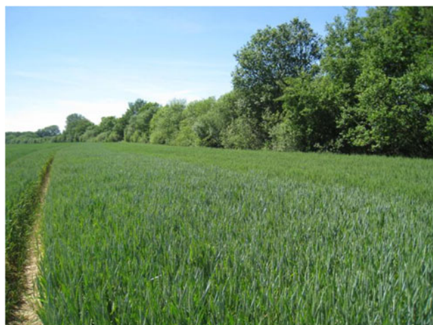
Fig. 2 Landscape elements surrounding a cereal field, southeastern France. Woody landscape elements for example can have different functions such as protection against wind and water erosion, habitats for beneficial insects and pollinators, production of timber and firewood, ecological corridors in agricultural landscapes, and biodiversity conservation