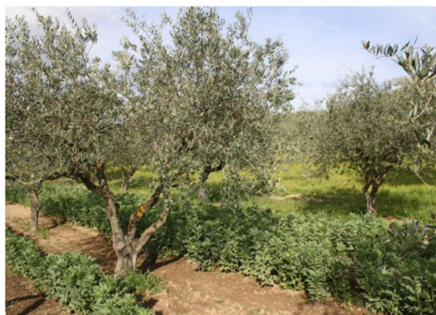
Fig. 5 Olive tree agroforestry system with undergrowth of leguminous species and grassland in Sardinia, Italy. This type of agroforestry system allows combining different crops on the same field. Resource use efficiency is increased because of different root systems, better nutrient cycling can be expected, legumes fix nitrogen, and below tree species cover the soil and wind and water erosion

Some plant species have the ability to produce chemical compounds which negatively influence the growth and development of weeds, pests, or diseases (De Albuquerque et al. 2011; Kruidhof et al. 2008; Tabaglio et al. 2008; Weston 1996). Therefore, the introduction of so-called allelopathic plants into crop rotations is a promising agroecological practice intending to reduce pesticide use while providing good crop yields. Allelopathic plants may be used as intercrops or cover crops. They have a direct effect on target organisms by