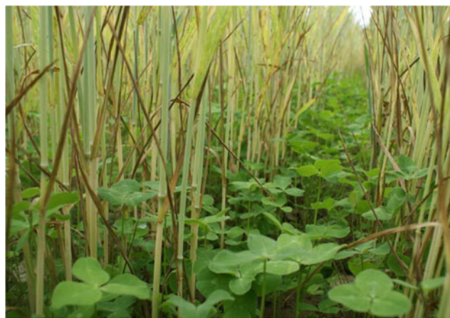
Fig. 4 Relay intercropping of wheat and undersown clover in southeastern France. In relay intercropping, leguminous species are often sown some weeks after the crop to reduce the risk of competition between crops. They assure a supplementary soil cover in particular after crop harvest. There, they limit nutrient leaching, wind, and water erosion, fix Nitrogen, and can potentially be harvested as forage

The intercropping systems are assumed to have potential advantages in productivity, stability of outputs, resilience to disturbance, and ecological sustainability, though they are generally considered harder to manage (Vandermeer 1989; Fig. 4). The main issue in such a system is managing competition for resources between the associated crops (Ong 1995; Ozier-Lafontaine et al. 1998; Van Noordwijk et al. 1996;