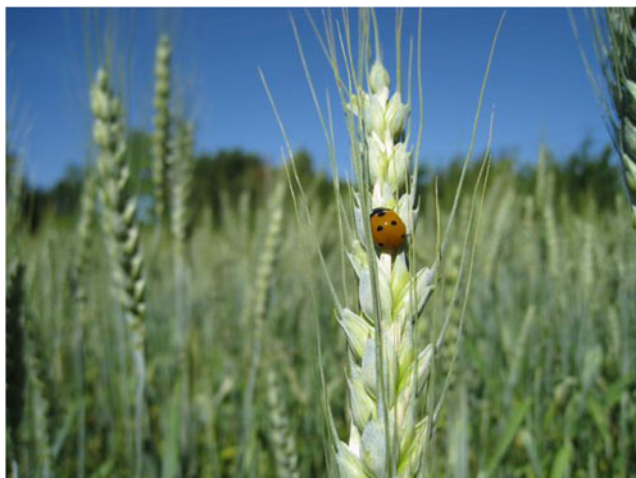
Fig. 1 Conservation biological control: preservation or creation of habitats near fields or in the larger landscape for reproduction, over-wintering, or shelter during different phases of life cycle of beneficial insects which then can control pests. The present photo shows a ladybird beetles, a natural predator of aphids, on organic wheat in southeastern France

Practices such as organic crop fertilisation, crop rotations, or biological pest control are well-known agricultural