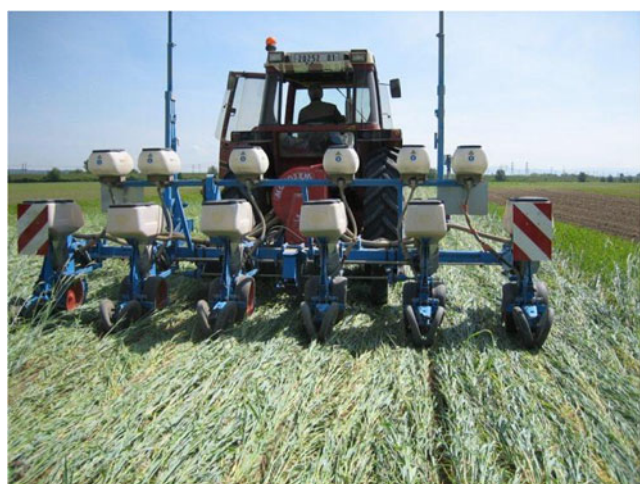
Fig. 6 Direct sowing of soybean into rye in southeastern France. This practice allows permanent soil cover and thus control weeds, decrease nutrient leaching, wind, and water erosion. Also soil organic matter is increased and higher soil biota activity achieved which leads to improved soil fertility

Reduced or no tillage practices help reduce energy inputs and thus increase cropping system efficiency. Other advantages are protecting the soil from erosion (organic matter at the soil surface), stocking organic C (less C mineralisation), and