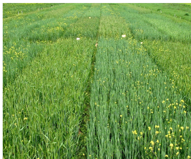
Fig. 1 Cultivar evaluation trials embedded in organic and low-input cropping systems: the first step to improve organic and low-input wheat growing.

The aim of this paper is to show that a trait-based functional categorization of agrobiodiversity can better highlight those approaches and solutions that are more likely to improve the sustainability of wheat production.