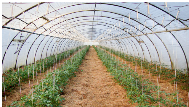
Fig. 1 Regional organic tomato cultivation in unheated plastic tunnels in Austria

practices (Lindenthal et al. 2010; Meisterling et al. 2009). Some research has been conducted to systematically compare the environmental burdens resulting from the entire tomato supply chain to the retailer in a manner that integrates agricultural production, including its upstream requirements, with those of the transport chains (Roy et al. 2008; Sim et al. 2007; Blanke and Burdick 2005; Andersson et al. 1998).