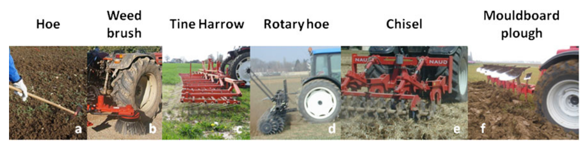
Fig. 4 Physical disturbances induced by various agricultural tools which are ordered according to their levels of magnitude of disturbances (a, c, d INRA; b Naturagriff; e, f Farcy, personal communication)