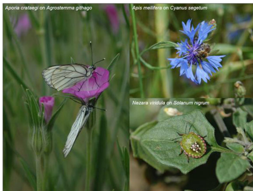
Fig. 1 Weeds provide shelter and food for various taxa of the agroecosystems such as those illustrated on these photographs, either beneficial species for pollination services or crop pests (Fried, personal communication). Therefore, the wise agroecological management of weeds should keep weed species of functional interest for regulation, e.g. biocontrol or trophic resources and cultural services