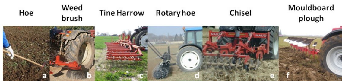
Fig. 4 Physical disturbances induced by various agricultural tools which are ordered according to their levels of magnitude of disturbances (a, c, d INRA; b Naturagriff; e, f Farcy, personal communication)