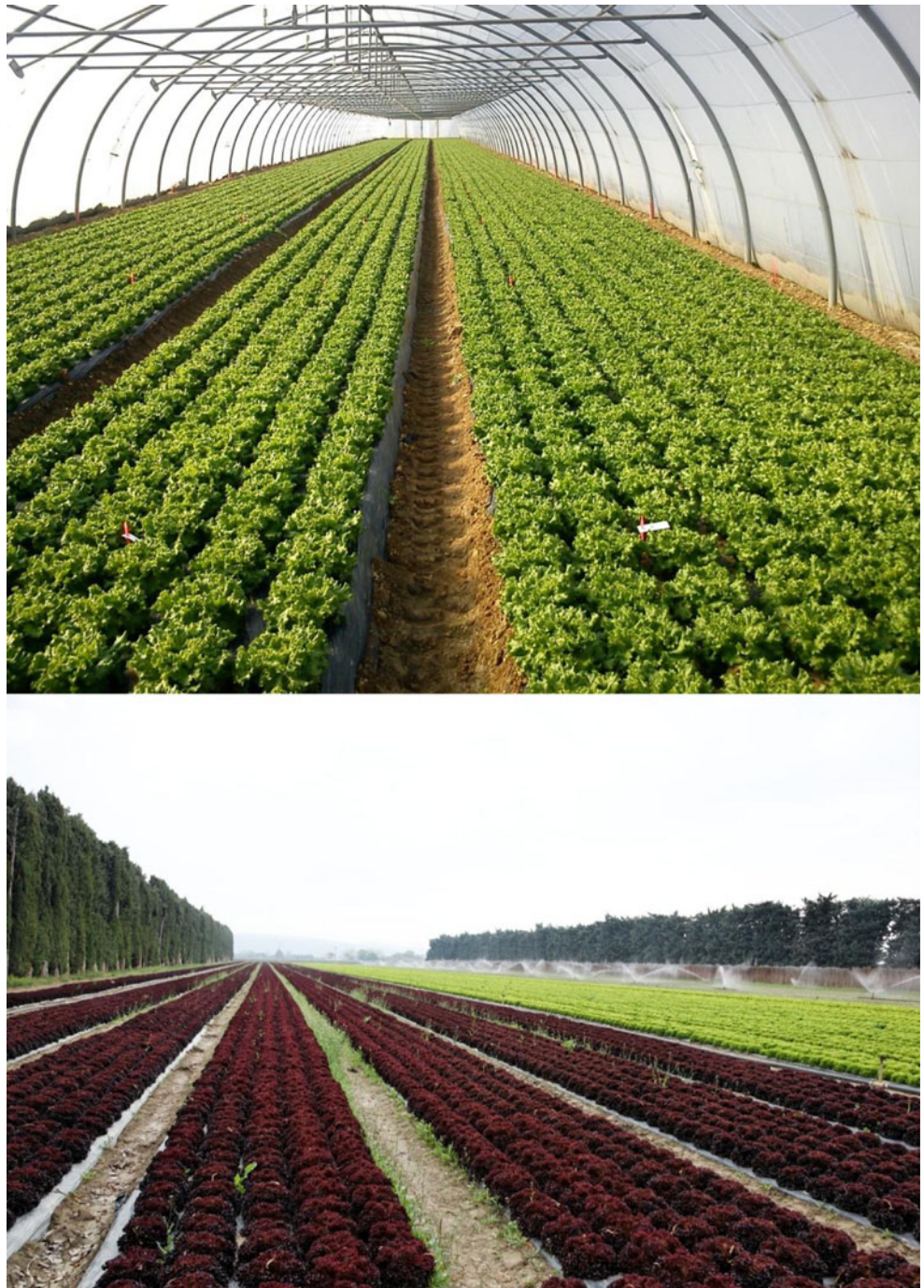
Fig. 1 Lettuce crops under shelter (near Montpellier—southeast of France) and in open field (near Tarascon—southeast of France)

(2011) for the root-knot nematode ( Meloidogyne spp.), and are sometimes specific to a single pest species. It appears critical, however, to consider all the different species that are likely to threaten the crop because the elements of the agroecosystem interact. Moreover, strategies for disease and pest management must integrate techniques compatible with the biological functions of agroecosystems (Lewis et al. 1997). As a result, knowledge of the mechanisms involved is required to understand the effects of each technique on