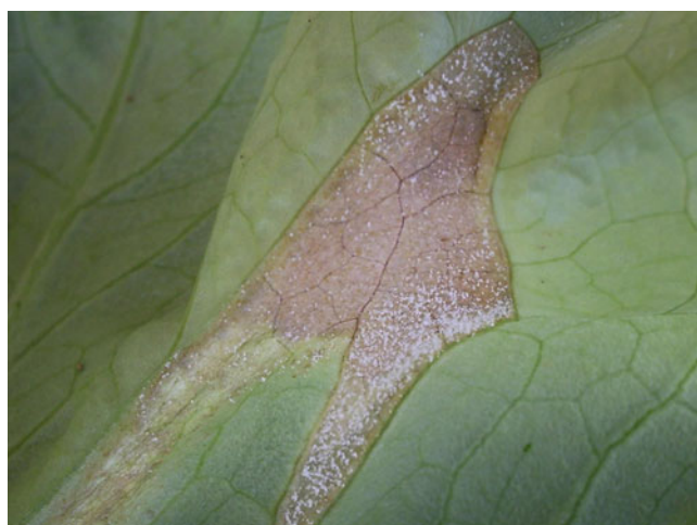
Fig. 2 Bremia lactucae sporangiophores forming a white, felt-like layer on the underside of a lettuce leaf.

One of the most important diseases of lettuce is downy mildew caused by Bremia lactucae (Regel). The pathogen may attack the plant throughout its crop cycle. The primary inoculum typically consists of airborne sporangia from diseased plants of the genus Lactuca located close to the crop or of mycelia present on plant debris in the soil. The sporangia of B. lactucae are typically released from the underside of leaves by sporangiophores, which form a white felt-like layer (Fig. 2) (Blancard et al. 2003). The optimal conditions for sporulation