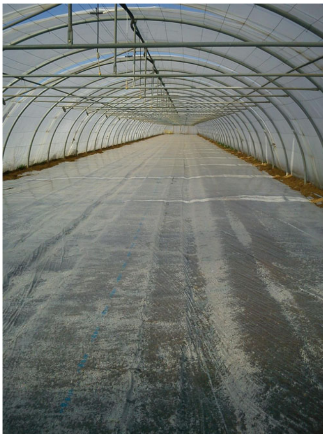
Fig. 4 Solarization performed under shelter to reduce soil inoculum

Nevertheless, a drawback of solarization is that the abundance of some beneficial organisms (e.g., arthropods) may also be decreased (Seman-Varner 2006). However, solarization-induced changes in the soil biota also promote heat-resistant or tolerant species and fast recolonizers, such as certain bacteria ( Bacillus spp.), fungi ( Trichoderma spp.), and free-living nematodes, that can enhance pest control services (Stapleton 2000). Solarization is well suited to the Mediterranean climatic conditions (Candido et al. 2008). It also fosters nutrient cycling because prolonged high temperatures promote nitrogen mineralization in the soil, which in turn can benefit the succeeding crop and even increase its yield (Hasing et al. 2004; Patricio et al. 2006).