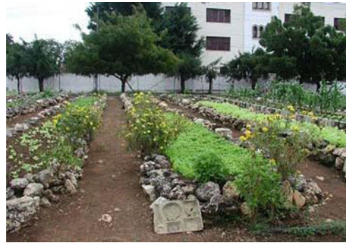
Fig. 1 Urban agriculture is practiced on an unparalleled scale in Havana, Cuba. Organopónicos, such as the one shown here, are one of the most common urban production systems in Cuba. They comprise simple raised beds with small retaining walls ( canteros).