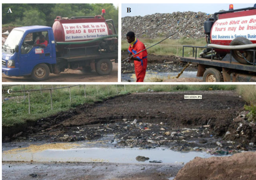
Fig. 3 Fecal sludge being delivered (A) and discharged (B) to a dewatering (drying) bed (C) in Accra, Ghana. The signs on either side of the truck indicate the value of fecal sludge as a resource. Photographs taken by A.J. Hamilton

(47 % of farmers), transport issues (14 %), negative perceptions of consumers (4 %), and public mockery (3 %) (Cofie et al. 2005). Also, competition for fecal sludge was cited as a frustration by 24 % of farmers, with reports of having to wait for 1–2 months not uncommon (Cofie et al. 2005). Nonetheless, the increased yields it delivers will undoubtedly ensure that farmers will continue to view it as a valuable resource. Residents, on the other hand, have more negative perceptions of sludge use, with a survey of the Efutu community in Ghana's Cape Coast Metropolitan Area revealing that 84 % agree that "Human excreta is a waste and suitable only for disposal" (Mariwah and Drangert 2011).