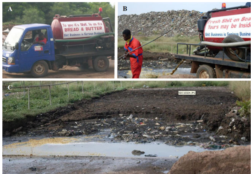
Fig. 3 Fecal sludge being delivered (A) and discharged (B) to a dewatering (drying) bed (C) in Accra, Ghana. The signs on either side of the truck indicate the value of fecal sludge as a resource. Photographs taken by A.J. Hamilton

(47 % of farmers), transport issues (14 %), negative perceptions of consumers (4 %), and public mockery (3 %) (Cofie et al. 2005). Also, competition for fecal sludge was cited as a frustration by 24 % of farmers, with reports of having to wait for 1–2 months not uncommon (Cofie et al. 2005). Nonetheless, the increased yields it delivers will undoubtedly ensure that farmers will continue to view it as a valuable resource. Residents, on the other hand, have more negative perceptions of sludge use, with a survey of the Efutu community in Ghana's Cape Coast Metropolitan Area revealing that 84 % agree that "Human excreta is a waste and suitable only for disposal" (Mariwah and Drangert 2011).