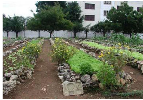
Fig. 1 Urban agriculture is practiced on an unparalleled scale in Havana, Cuba. Organopónicos, such as the one shown here, are one of the most common urban production systems in Cuba. They comprise simple raised beds with small retaining walls ( canteros).