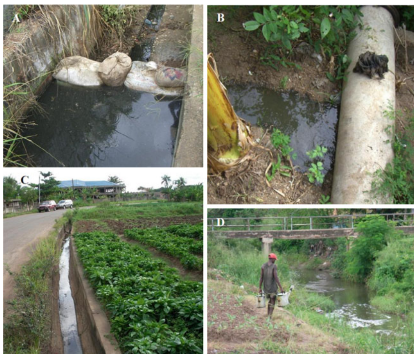
Fig. 4 Sources of wastewater for irrigating urban vegetable plots in Accra, Ghana. A Greywater collection for irrigation of an adjacent crop. B Sewer-mining to flood-irrigate a crop. A hole punctured in the bottom of the pipe is stoppered with a rag (placed on top of the pipe in this photo) that can be removed when irrigation is required. C Open street drain carrying stormwater, sewage, and greywater. D Manual collection of water from an urban stream immediately downstream from a raw sewage discharge point.

risks, but will depend largely on uptake rate (Amoah et al. 2011). An analysis conducted by Seidu and Drechsel (2010) found that cost-effectiveness ratios were highly sensitive to the adoption rates of non-treatment interventions, such that in a two-barrier approach (interventions on- and off-farm) 75 % adoption of at least one intervention was required. Yet current awareness amongst farmers is very low, with >85 % in Tamale possessing no knowledge of safe irrigation methods (Abubakari et al. 2011). Karg and Drechsel (2011) highlighted the challenges in effecting behavioral change. They found that risk awareness was very low among farmers and consumers alike, and they suggested that low-cost practices are important but insufficient on their own to elicit change; financial benefits, in terms of higher revenues, were believed to be more powerful incentives.