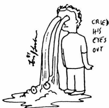
Figure 2. Pictorial representation of a hyperbolic reading of John cried his eyes out , from Mateu and Espinal (2007)

Of course, there is some motivation why puke combines with guts and cry and bawl with eyes , rather than vice versa. The motivation is, of course, that if one pukes , contents of one’s guts are ejected, and that if one cries , tears flow from one’s eyes. Similarly, [V one’s lungs out ] naturally attracts verbs denoting an activity of forceful air expulsion, such as scream , cough , cheer and yell . In each of these cases, the metonymical construal (container for contained), may be supported by a conceptual metaphor according to which an intense activity can be represented as an excessive change of location, in casu the exhaustion or detachment of a body part (Mateu and Espinal 2007; Espinal and Mateu 2010). An utterance such as John cried his eyes out may therefore be paraphrased most accurately not just as ‘John cried intensely’ (cf. Jackendoff 1997a, b, 2002a, b) but as ‘John cried so much that his eyes almost came out’, as represented in Figure 2.