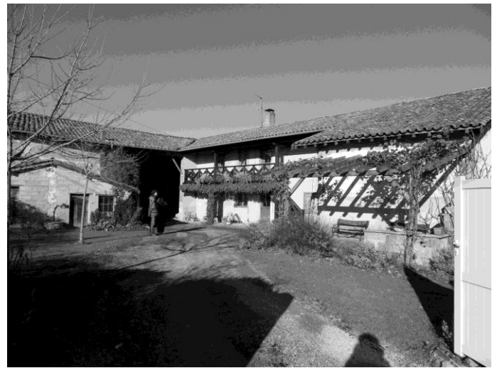
Figure 2. One of the rural Dombes houses from the sample.

Moreover, the use of the buildings as permanent habitat for non-farmer residents fosters the differentiation in spaces management (Figure 2). The search for big volumes, spaces and comfort inside the house lead to the spread of two levels spaces distribution, and to an increase of inhabited space at the cost of intermediate spaces. Those were previously associated to the thermal envelope such as, for example, an attic full of straw and grain. In the same direction we observed a tendency to create and enlarge openings to provide wider and brighter spaces.