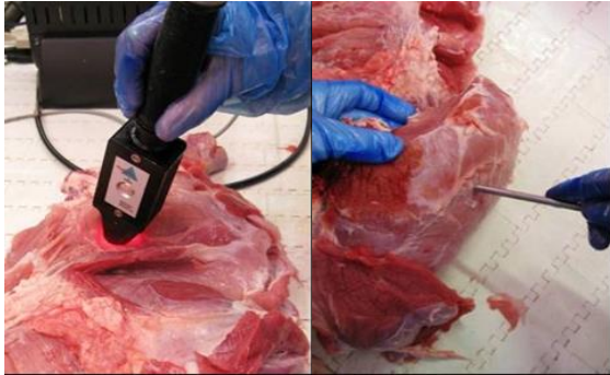
Figure 1. BTS probe (left) and BTP probe (right).

validation procedure the calibration sets were randomly divided in a 66 hams population for model determination while 33 hams served for cross validation. Cross validation were run one hundred times with PLS component numbers varying from 1 to 20 (figure 3). The PLS component number that was used for the prediction model determination corresponded to the first minimum of mean of false classification rate in cross validation.