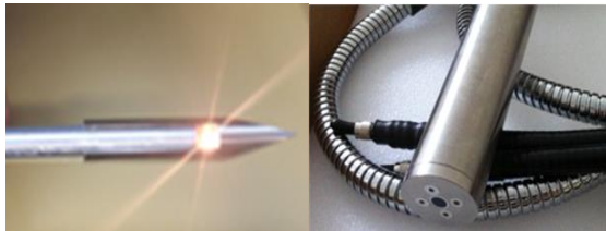
Figure 2. FOP probe (left) and FOS probe (right).